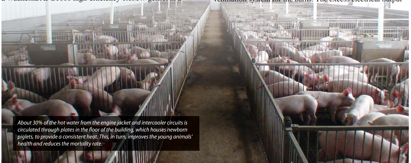
About 30% of the hot water from the engine jacket and intercooler circuits is circulated through plates in the floor of the building, which houses newborn piglets, to provide a consistent heat. This, in turn, improves the young animals’ health and reduces the mortality rate.

The solution adopted by CPC in early 2009 was to use methane from the animals’ waste – a true renewable resource – as the fuel for an onsite power plant. The power plant is a Waukesha APG1000 high-efficiency 1.1MW genset in a