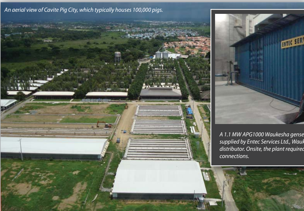
An aerial view of Cavite Pig City, which typically houses 100,000 pigs.